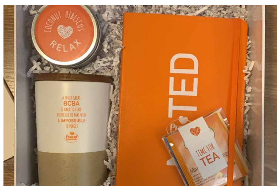
Attentive BCBA welcome box